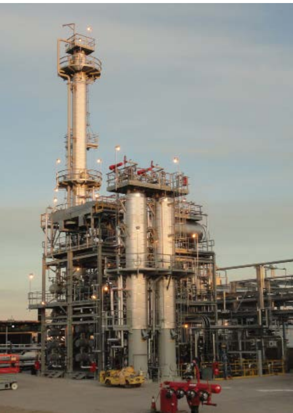
Badger BenzOUT technology at Husky Energy's refinery in Superior, Wisconsin.

Our benzene reduction technology can help you meet benzene regulations, increase octane and improve your refinery economics.