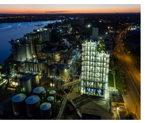
Manildra - Extra Neutral Alcohol Unit. Australia