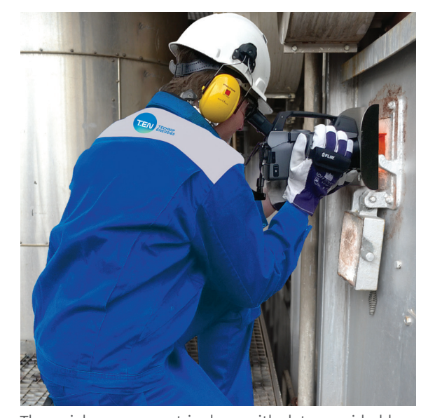
The quick assessment is done with data provided by an infrared camera.

Whether in hydrogen, ammonia, carbon monoxide, methanol or syngas applications, the reliability of a steam reformer is essential for continuous, efficient operation of a processing plant.