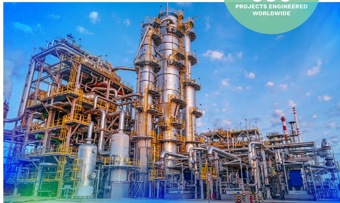
Duslo A.S ammonia plant, Slovakia

MORE THAN 350 PROJECTS ENGINEERED WORLDWIDE