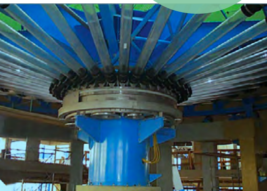
UCEGO vacuum table filter