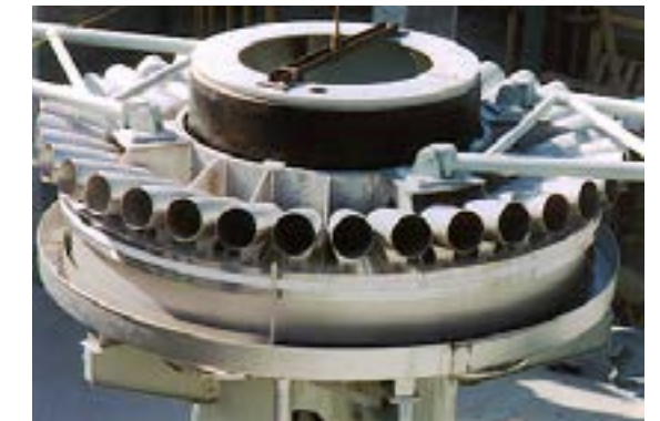
FILTER VALVE The upper part of the filter valve is easily raised for fast inspection or adjustment