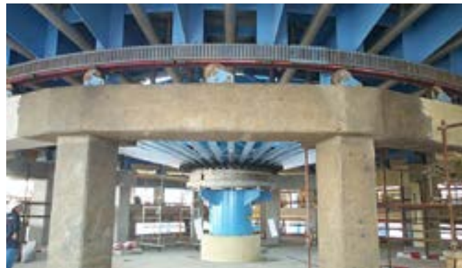
TABLE DRIVE UNIT

The stainless steel screw is adjustable in height, and equipped with replaceable wear flights.