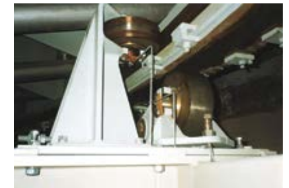
SUPPORT AND CENTERING ROLLERS Filter frame is supported and centered by sets of rollers mounted on nodular cast iron supports