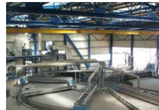
UCEGO NO. 12 A Under assembly – general view