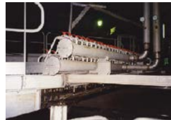
CLOTH AND TABLE WASHING The cloths are cleaned under pressure by two spray banks fed by one or two central manifolds. Residual gypsum is removed and cloths and table are washed to prevent scaling.